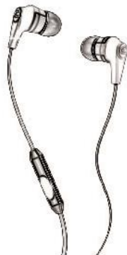
Ctroniq Earbuds with remote and mic